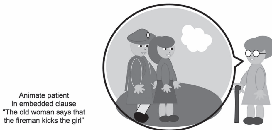
Fig. 2. Illustration of a sample trial from Experiment 2. In this event, an event with an animate patient is embedded within another event.

the reversibility of the event being described, then more SVO word orders should be produced for events in which both participants are human, and thus equally likely to be the agent or patient, than for events in which there is only one human participant. Participants saw eight transitive events with inanimate patients (e.g., "girl kicks ball"), eight transitive events with human patients (e.g., "girl kicks fireman"), and eight intransitive events (distractors). The same eight actions were used for the human and inanimate patients (pushing, poking, kissing, throwing, kicking, rubbing, elbowing, and lifting).